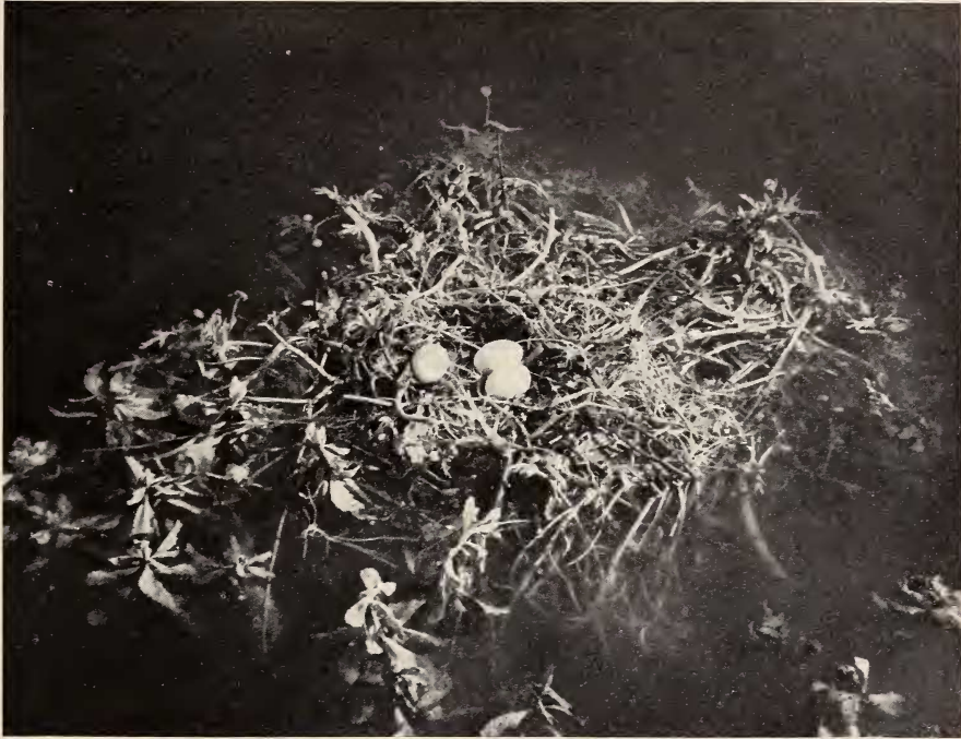
Fig. 3. Typical, rather vulnerable nest of the Black-necked Grebe.

ties under these conditions even if the eggs were in an advanced state of incubation. One is rather inclined to assume this building activity at this late stage either to be or to have developed as a displacement behaviour. Armstrong (1950) suggested that in the Black-headed Gull Larus ridibundus L. displacement nest building was stimulated by the seepage of water into the nest during slow floods. Moynihan (1953) argues that displacement nest-building has „practical“ advantages and that it is perhaps because of the practical advantages that displacement nest-building is the commonest of the displacement activities that result from a thwarted incubation drive. It is of course possible that in a species which builds such vulnerable nests as the Black-necked Grebe, nest-repair building activity originated as a nest-building displacement activity but that it gradually became a normal autochthonous behaviour with a very necessary or perhaps better, practical function. It would be interesting to investigate how frequent nest-repair building activity occurs in other species of birds building flimsy nests either on or along the edges of the water. The actual progress in the Black-necked Grebe breeding colony at the Strandfontein Disposal Works and the survival rate will be dealt with in a separate paper. In the present paper we will only concern ourselves with the behaviour of the incubating bird when disturbed.